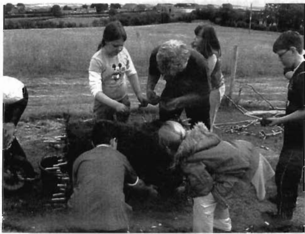
Apprentice Mediaeval Builders