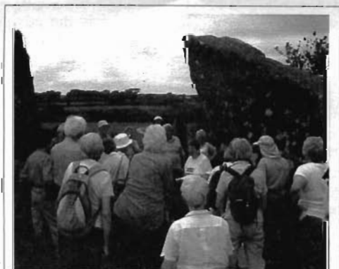
Bryngwyn Standing Stones