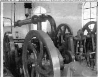
Edwardian Gas Engine