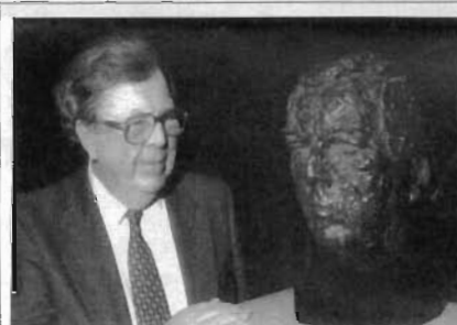
Arglwydd Cledwyn o Benrhos

Darlith Flynyddol Gŵyl Gelfyddydau Caergybi 2004