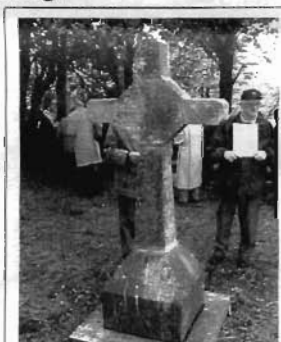
Site of St Ulched's Church

Several non-members who we regard as friends have joined us and have been impressed by what we do and how we do things.