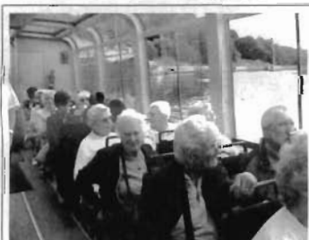
On the way to the Lift