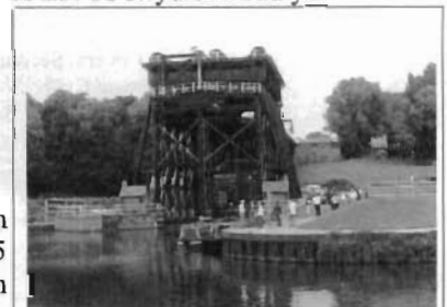
Anderton Boat Lift